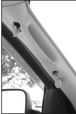
Dodge Ram Shown (Photo 1)