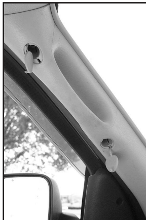
Dodge Ram Shown (Photo 1)